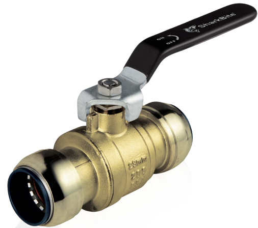
SharkBite 10mm - 28mm

Rigorous manufacturing and quality control, as well as long-term internal product testing, ensure the durability and seamless performance of the SharkBite Air & Pneumatics fittings.